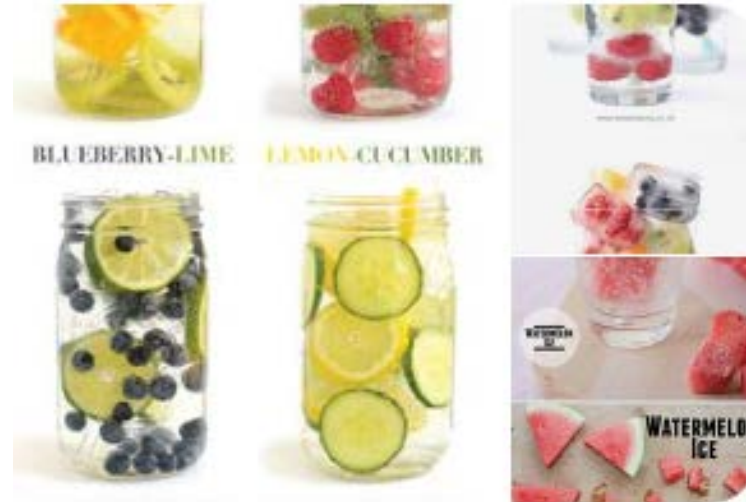
Rethink Your Drink