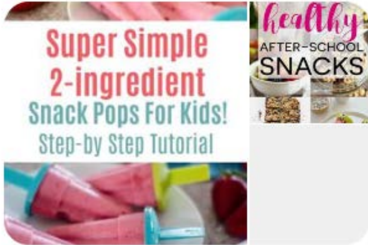
Smile Friendly Snacks